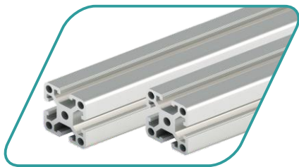
Aluminium alloy material